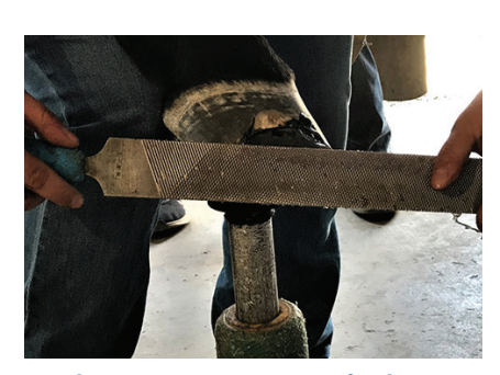
6. When putting a rasp to a fresh repair, it's important that the initial strokes are done in line with the longest span of the repair, in this case, horizontally. This avoids pulling at the repair and possibly weakening the bond.