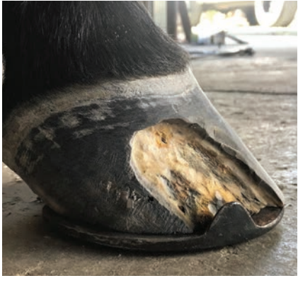
1. Preparation is critical to any adhesive repair. Note the resection stops where there is solid hoof wall attachment.

The decision was made to do a partial repair to stabilize the hoof and protect it from a dirty environment. Because there was a soft spot in the upper portion of the defect that got a negative reaction to applied pressure, the conservative approach dictated leaving it open to allow monitoring and further treatment if needed.