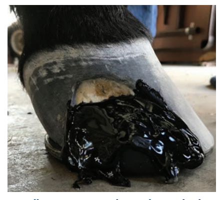
5. Adhesive repairs don't always look great until dressed with a rasp.

3. To control the heat generated by the adhesives used in the equine industry, it's important to apply it in layers rather than all at once. Vettec Adhere will set in 60 seconds, and this first application will provide an insulating layer to prevent additional layers from transferring heat to the foot.