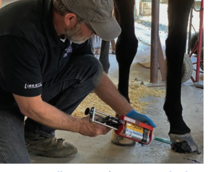
4. Vettec Adhere is a fast setting, high strength urethane that bonds well, and can be nailed and clinched. It is similar to hoof wall, and can be nipped and rasped off as the foot grows out.