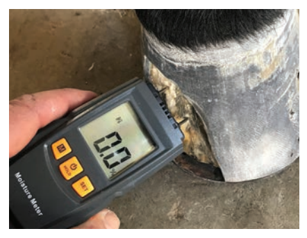
2. The prepared area is dried with a heat gun to maximize the bond. Drying is monitored with a FootPro™ Moisture Meter to get the surface moisture level below 10%. Ideally, zero percent moisture is desirable, and was achieved this time.

3. To control the heat generated by the adhesives used in the equine industry, it's important to apply it in layers rather than all at once. Vettec Adhere will set in 60 seconds, and this first application will provide an insulating layer to prevent additional layers from transferring heat to the foot.