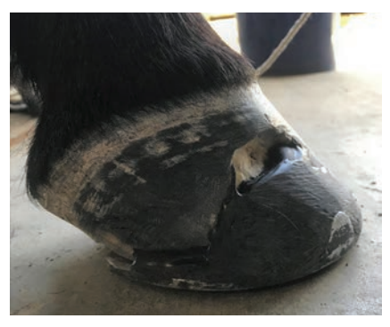
7. Dressing for function is far more important than aesthetics, leaving the repair on the thicker side is fine for this situation.