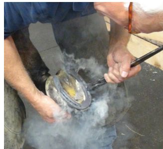
Checking fit using Bloom Forge hot fit tongs.