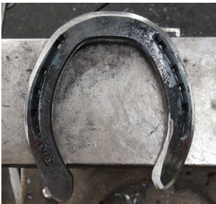
Kerckhaert DF Select shoes have a longer outside branch to allow for more support.