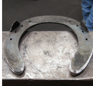
Final grind on heels to allow for clean out and safety.