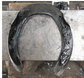
Modification of the extended heel provides good lateral support for the hind foot.