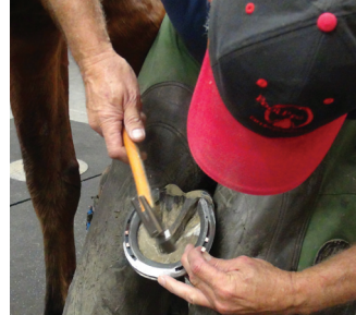
Nailing with Liberty Cu Hybrid size 3 nails. The Hybrid series fit all shoes punched for E-head, including concave shoes.