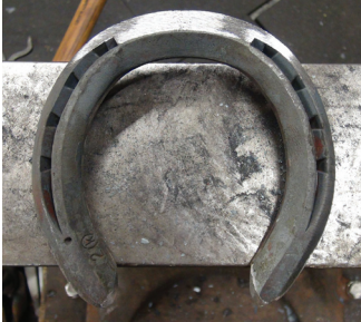
Classic Roller after shaping and final grinds. Great shoe for a lot of horses.