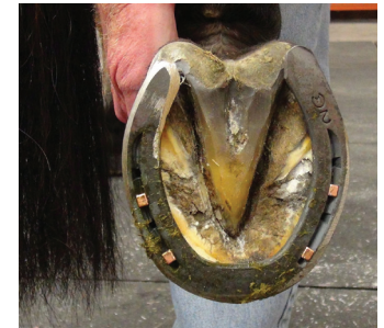
The clips of the DF Select also help minimize the number of nails needed to secure the shoe. Bobby has done a nice job providing lateral support and safing the medial heel.