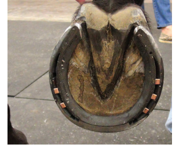
Kerckhaert Classic Roller clips minimize the number of nails needed to secure the shoe.