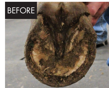
Bottom of right front - before. Medial toe flare is obvious.