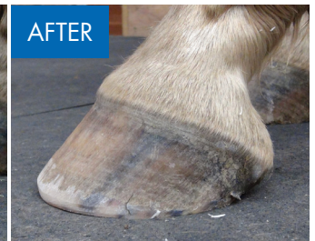
Left front lateral - after. Note "pasture roll" of wall.