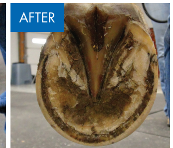
Right front bottom - after.