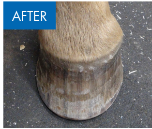
Left hind - after. Slight flare inside was dressed.