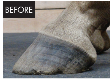
Left hind lateral - before.