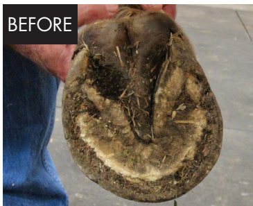
Bottom of left front - before. Medial flare is noticeable.