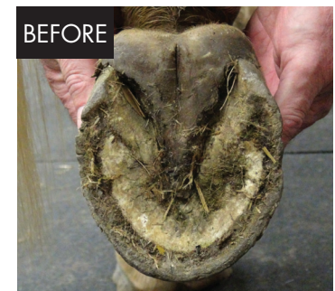
Right hind bottom - before. More symmetrical than left.