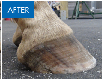
Right front lateral - after.