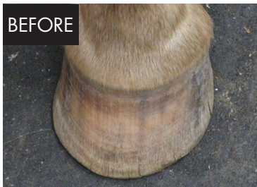
Left front - before. Horse is slightly pigeon toed and has medial flare.