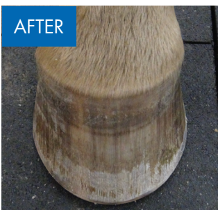
Right hind - after.