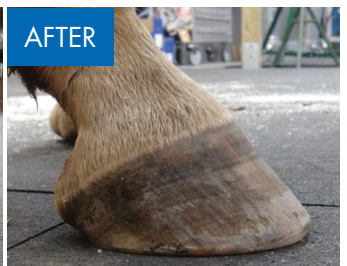
Right hind - after. Pasture roll applied.