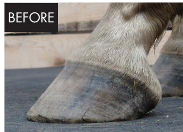
Left front lateral - before.