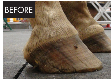
Right front lateral - before.