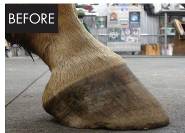
Right hind lateral - before. Solid foot.