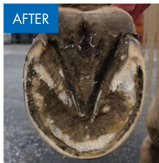
Left hind bottom - after. Flare has been dressed.