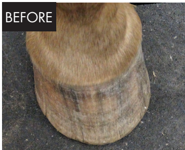
Right front - before. Note this foot is narrower than the left front.