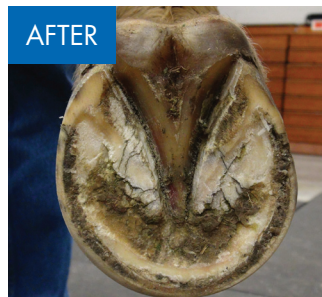
Left front bottom - after. Foot is showing better balance with flare also dressed. Plenty of sole left for protection.