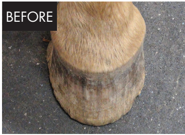
Left hind - before. Hoof shape matches coronary pretty well.