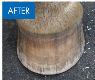
Left front - after. Flare has been minimized with light rasping.