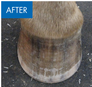
Right front - after. Medial flare has been reduced.