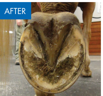
Right hind bottom - after. Sole and bar integrity is good after trim.

Watch a video of Conrad trimming Shy on Facebook at https://www.facebook.com/watch/?v=1636023163238344