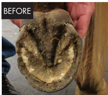
Left hind bottom - before. From here you can see the slight flare at medial heel quarter.