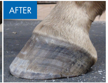
Left hind lateral - after. Pasture roll applied to hoof edges.