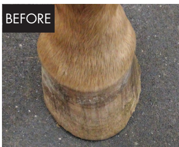
Right hind - before. Also matches up well to coronary.