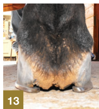
4 - Trimmed frog to locate true apex 5, 6, 7 - Trimmed to reach goals for balance and form 8, 9 - On ground we can evaluate angles and alignment 10, 11, 12, 13 - Shod with SX-8 clipped steel, notice additional support of fit in 12 and 13