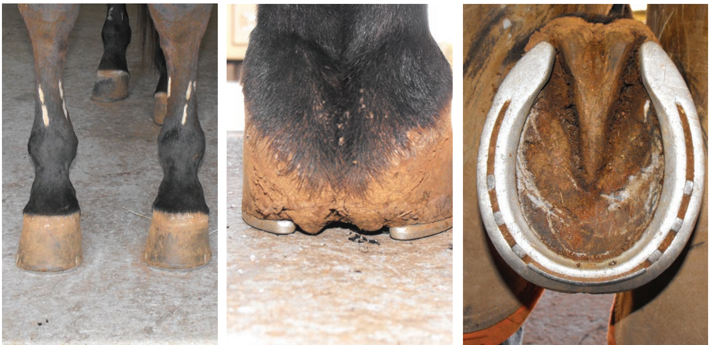
Above: Various Views prior to shoeing, notice signs of nerving procedure in image to far left.

The first thing we looked at is the overall conformation of the horse and how he is shod. He is not the straightest legged horse we had ever seen, but we both have seen worse. You can also see where he has been nerved in the past. He was shod just as you would expect, a little extra foot and a hunter fit (spot on). Since we had the luxury of a break from show biz we could think in terms of more support and gathering up the feet. We just want to make sure that we put the foot in the center of the leg and the foot and leg in the center of the shoe.